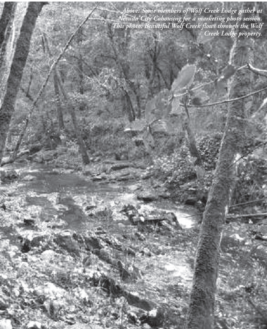
Above: Some members of Wolf Creek Lodge gather at Nevada City Cohousing for a marketing photo session. This photo: Beautiful Wolf Creek flows through the Wolf Creek Lodge property.